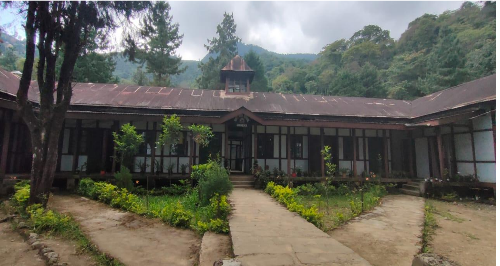
Government High School, Kigwema